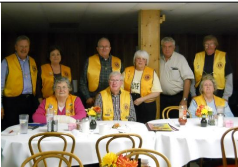
Middleton Lions Club visit 11/14/11