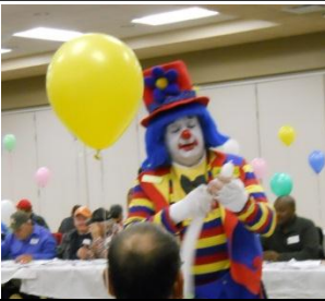
Making balloon shapes for everyone