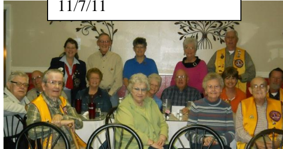
Troy Lions Club visit 11/7/11