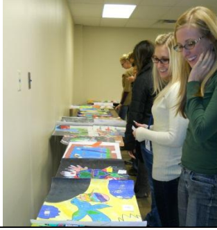
Members of the Memphis Southern College of Optometry Lions Club choose from the 27 entries submitted on November 10, 2011