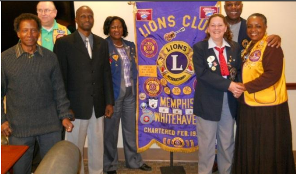
Memphis Whitehaven Lions Club visit 11/1/11