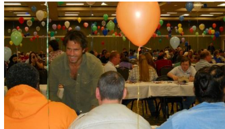
Shawn Christian (aka Dr. Daniel Jonas on Days of Our Lives) talks to members of the crowd.