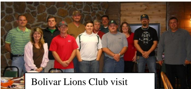
Bolivar Lions Club visit 11/8/11