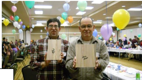
Showing off their autographs on pieces of board they got to "karate chop" in half!