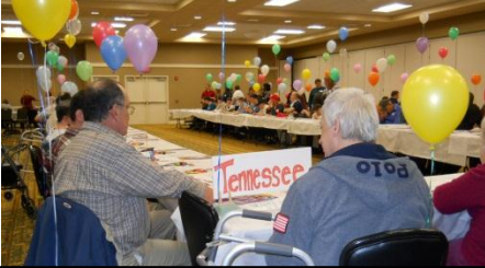
Clients from Tennessee await the arrival of the "Stars" at the Autograph Party on Saturday afternoon.

Many of the Northwest Tennessee Lions Clubs support this annual event through storefront collections and roadblocks. These Lions Clubs include the Cottage Grove Lions ($1500+), the Dresden Lions ($2200+), the Martin Lions ($450), the Troy Lions ($700), and the Union City Casey-Johnson Lions ($1000).