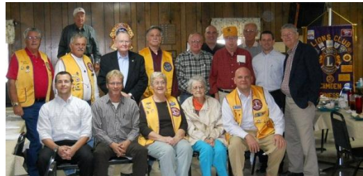
The Camden Lions Club 10/24/11