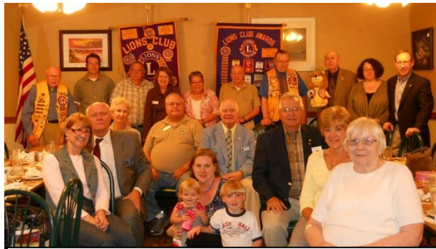
The Germantown Lions (& Cubs) Club 10/10/11