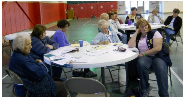
Conducting member and officer training in Bradford