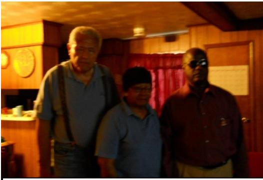
Memphis Bluff City Lions Club 10/13/11