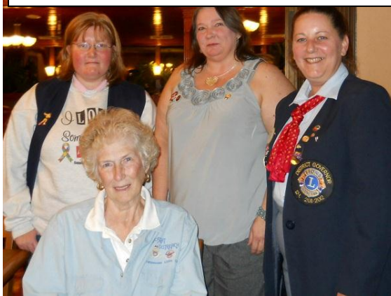
Working to rebuild the Dyersburg Lions Club 10/27/11