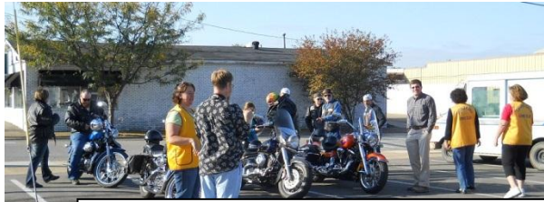
Getting ready to take off for the Fun Run