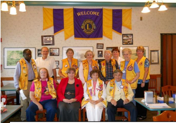
The Millington Lions Club 10/11/11