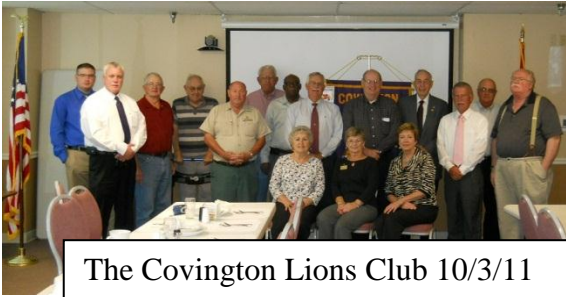
The Covington Lions Club 10/3/11