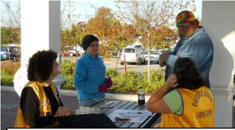
Registering riders at the Cottage Grove Lions Fun Run 10/8/11