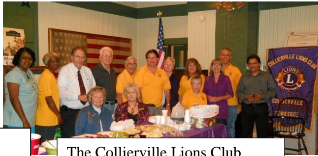
The Collierville Lions Club