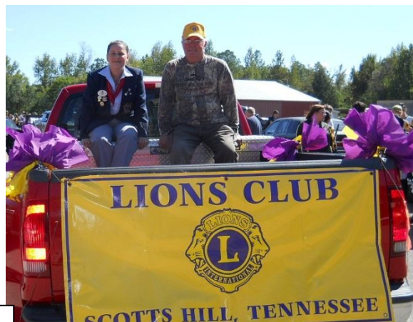
Riding in the Scotts Hill parade!