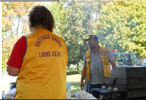
Waving goodbye to the riders... see you in Cottage Grove for lunch and prizes!