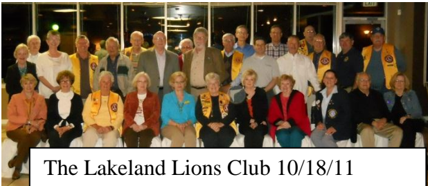
The Lakeland Lions Club 10/18/11